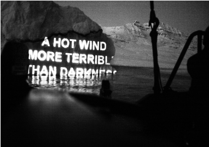
A Hot Wind More Terrible Than Darkness, Buckland / Balkin